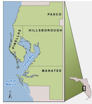
Figure 1. Map of the four county region served by the CSAP.

recommendations for local governments and regional agencies as they make decisions about responding to climate change and associated SLR. The CSAP has assessed the best available scientific data to determine a regional set of SLR projection scenarios through 2100. With this shared projection, local governments can coordinate, develop, and implement appropriate coastal adaptation and risk reduction strategies. This document briefly explains the technical methods used to produce SLR projections and offers the CSAP's rationale for the most appropriate SLR projections to use for planning and policymaking throughout the Tampa Bay region.