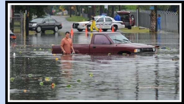
Tampa Tribune May 2014